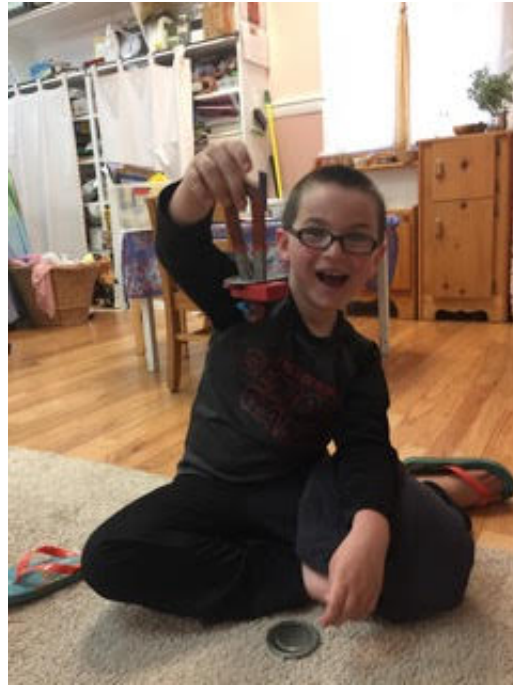
Exploring with Magnets

(I have printed out the complete letter and have copies in the office. If you are interested, let me know and I'll send one home with your child. Mrs.B)